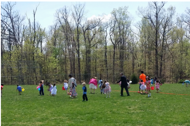
Egg-cited kids looking for eggs