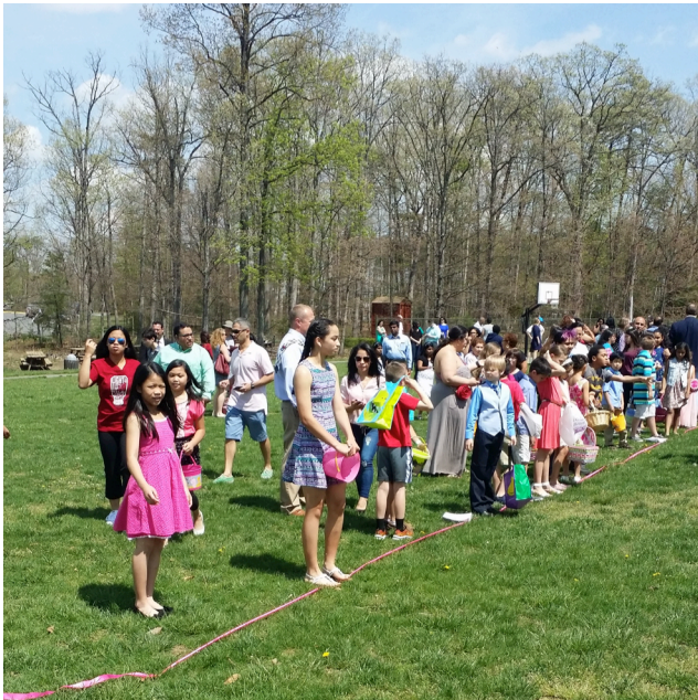
Lining up for the Hunt